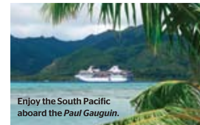
Enjoy the South Pacific aboard the Paul Gauguin.

TOP FEATURES: Named for the famed French Post-Impressionist who painted the languid atmosphere of Tahiti, this upscale ship is an ideal ride since it’s specially designed to sail the shallow seas of French Polynesia and the South Pacific. Gourmet Polynesian cuisine is sourced with local ingredients and even the spa treatments incorporate native botanicals such as hei poa, or red flowers. The itinerary provides unique access to the stunning natural landscape — you can lounge on the pristine beaches of the magnificent volcanic islands, dolphin-watch at Moorea, snorkel off Bora Bora, or spend the day on your own private motu (islet) off Taha’a.