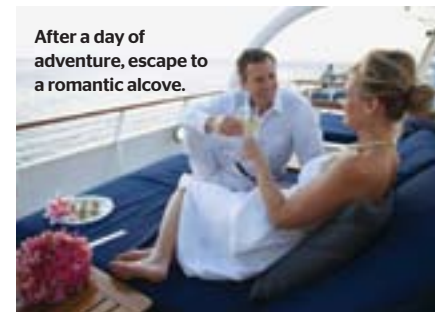
After a day of adventure, escape to a romantic alcove.

TOP FEATURES: Designed to feel like your own personal yacht (sigh, if only), the SeaDream Yacht Club’s fleet only carries 112 passengers, max. Thanks to their smaller size, the ships can visit harbors and ports where larger boats can’t go, including tiny, exclusive Norman Island in the Caribbean. Sporty types will love all the toys at their disposal in the ship’s marina. Twin-hulled Hobie Cats, Laser sailboats and all-transparent Molokini kayaks are just some of the options you can tool around in ports such as the Spanish Virgin Islands of Culebra, Culebrita and Vieques.